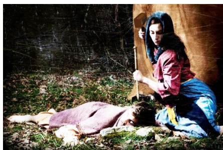
Tent Peg In Enemies Head Israel is Rescued by a Woman