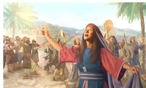
Deborah & Barak Sang A Song People volunteered..., bless God!

Does God's Story in Scriptures reveal how he calls and uses women in leadership? Why would he do that?