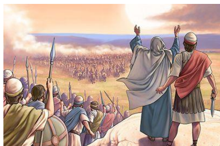
Soaked Ground Sink Chariots Now how did that happen?